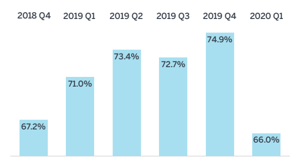
FIGURE 1: FUNDED RATIO

In aggregate, the PPFI plans experienced investment returns of -10.81% in Q1, with individual plans' estimated returns ranging from -17.41% to 4.76%. The Milliman 100 PPFI asset value decreased from a PPFI high of $3.979 trillion at the end of Q4 2019 to a PPFI low of $3.536 trillion at the end of Q1 2020. The plans lost market value of approximately $419 billion, on top of net negative cash flow of approximately $24 billion.